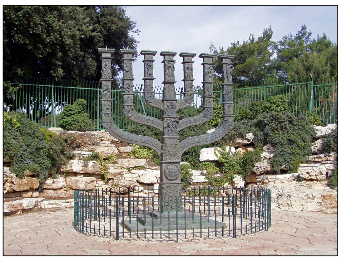
The Great Menorah in Jerusalem